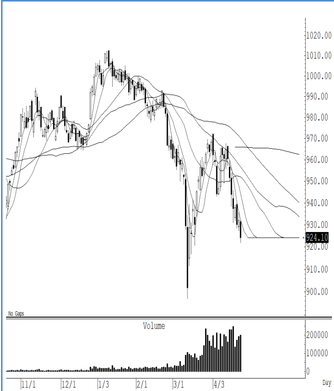
S50M23 (Close 924.10 Chg -8.0)